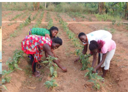
Students in Afféry IFER (Ivory Coast)