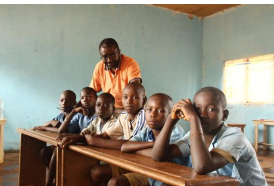
Students in class at the FFS in Ndélélé (Cameroon)

95% of graduates consider dual pedagogy training is an asset.