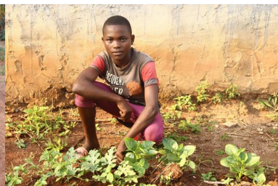
Practical workshop in Dizangué (Cameroon)