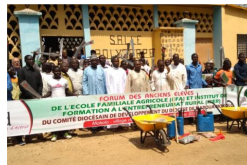
Alumni forum at Mokolo, Cameroon