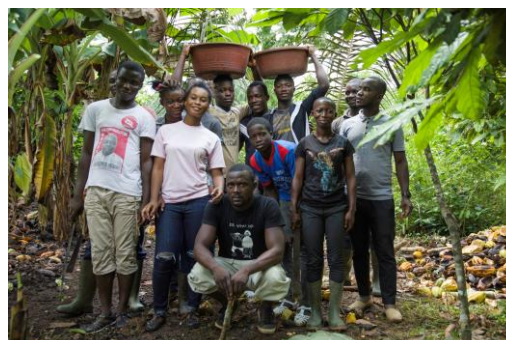
Afféry students on a study visit to the SACO cocoa plantation, Ivory Coast