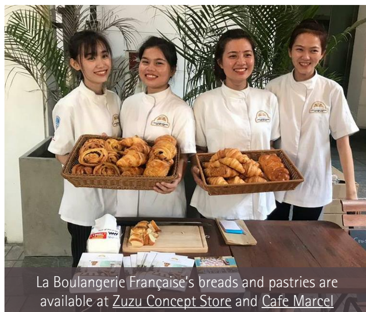
La Boulangerie Française's breads and pastries are available at Zuzu Concept Store and Cafe Marcel

At the same time, ten new students were recruited on socio-economic criteria to join the training and benefit from the experience of the 10 students remaining from the first batch. The next wave of interns and new recruits will happen in May 2019, and applications are open until April 21 st , 2019.