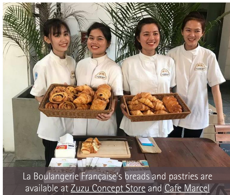
La Boulangerie Française's breads and pastries are available at Zuzu Concept Store and Cafe Marcel

At the same time, ten new students were recruited on socio-economic criteria to join the training and benefit from the experience of the 10 students remaining from the first batch. The next wave of interns and new recruits will happen in May 2019, and applications are open until April 21 st , 2019.