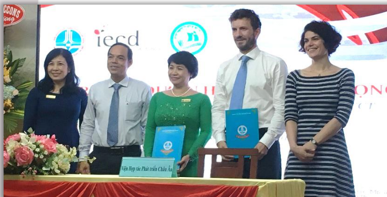
Official ceremony for the launch of Seeds of Hope in Vietnam

On September 27, 2017 in Ho Chi Minh City, the Seeds of Hope programme was officially launched in Vietnam. A ceremony was organized and gathered no less than 60 collaborators including representatives from the two partner schools – Thu Duc College of Technology (TDC) and Ho-Chi-Minh City Technical and Economic College (HOTEC) – as well as Vietnamese officials and representatives from partner NGOs. Several companies were also present to reaffirm their interest and support for the project. The ceremony announced the welcoming of a first batch of students supported by the project , with more than 260 students registered. We wish them all the best in their training!