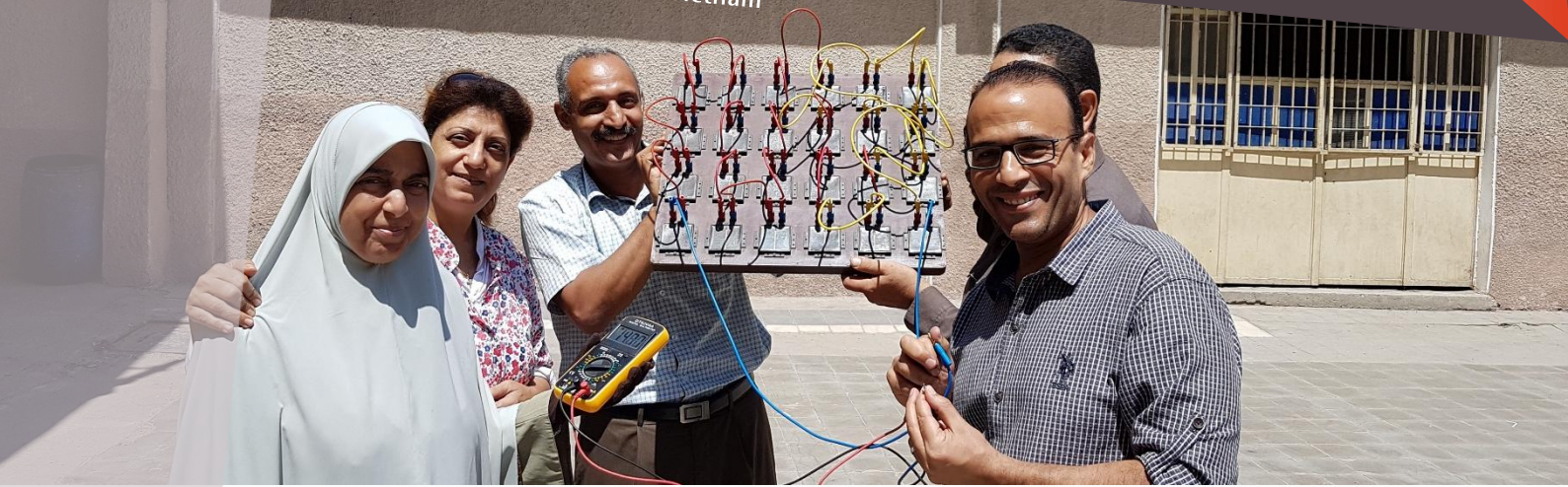
Public school teachers receiving training on photovoltaic technology (Egypt, August 2017)