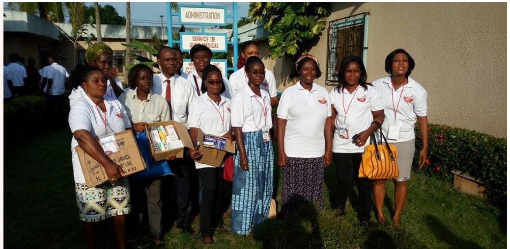
Visit to the medical Center and material donation

The third Top Leader seminar took place last 9th & 10th of June in Bouaké. Participants could choose between two working groups: the first one dealt with innovative management techniques for growing SMEs and the second one addressed the revision of business models for a sustainable performance. This falls within the 2015 Top Leader seminar. 32 entrepreneurs took part to this third edition and a caritative action like the one in 2016 was set up.